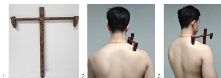
Figure 1. Self-ischemic compression: 1) a T-shaped wood stick, 2) and 3) Holding a T-shaped wood stick over upper trapezius MTrP and pulling the stick to compression

All participants were asked not to take any analgesic medication or other physical therapy during the study, They