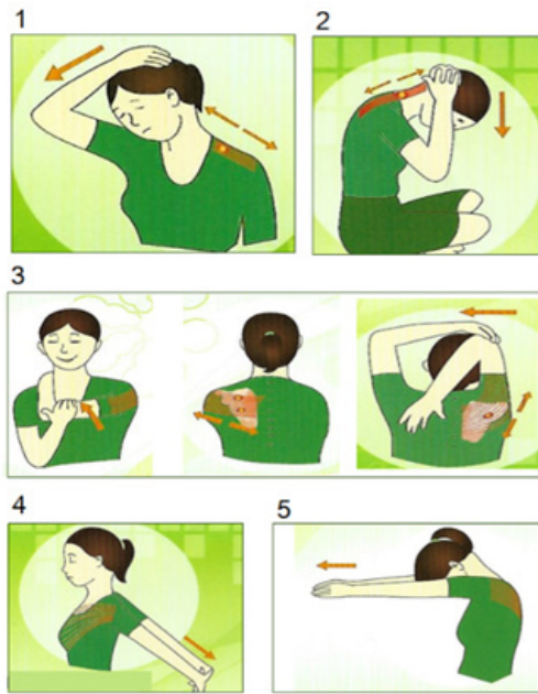
Figure 2. Self-sustained stretching exercises of the following muscles: 1) upper trapezius muscle, 2) posterior neck muscles, 3) middle trapezius and rhomboid muscles, 4) pectoral muscle, and 5) upper back muscles

were informed to report any intolerable soreness and other feelings induced by the instructed treatment, and record their adherence to the instruction in a provided logbook.